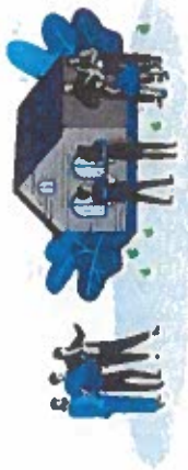
Repairing primary homes