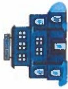
Repairing second homes