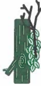
Repairing short-term rental properties