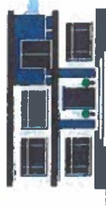
Renting temporary housing