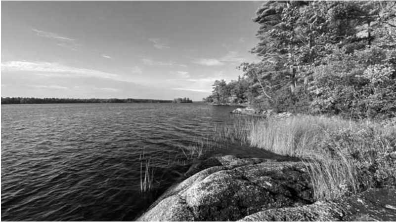
Pemaquid Pond Preserve in Bremen

Contact us at 207-563-1393 or info@coastalrivers.org .