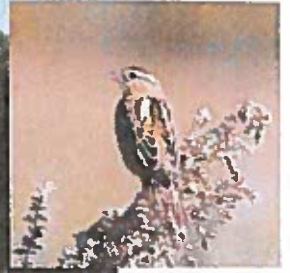
Hay Conservation and Recreation Area